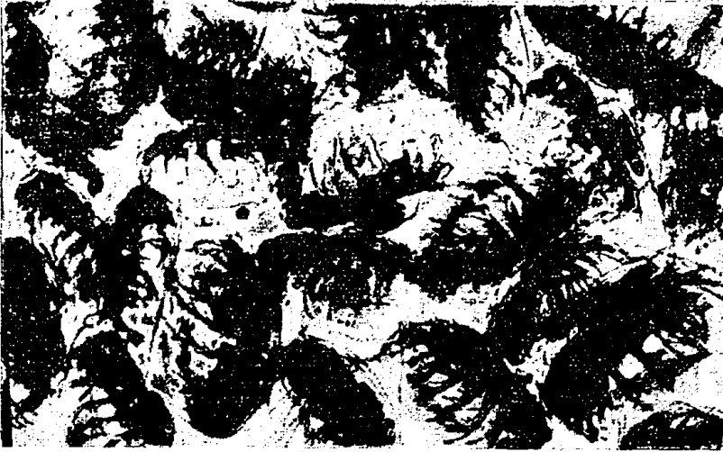
Fig. 3 A swarm of Penilia avirostris